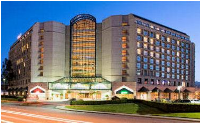
Hyatt Regency San Francisco Airport

Look for your shipmates in the commons areas or at the hospitality room located Cypress A.