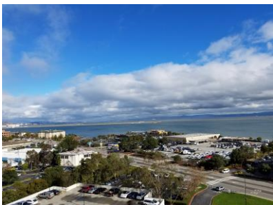
A view from one of the rooms.