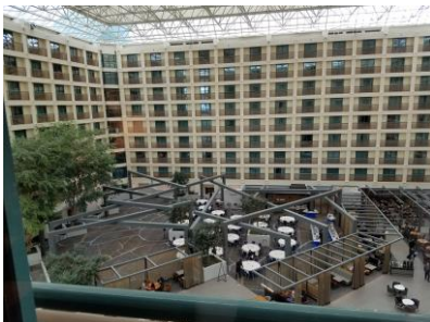
The commons area of the Hotel – a place to find your shipmates.