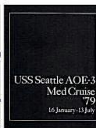
USS SEATTLE AOE-3, MED Cruise '79, 16 January - 13 July. Anon. Norfolk, Virginia: Tiffany Publishing Company, (1979). Unpagged, black hardcover with white printing and white piping.