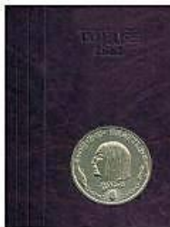
U.S.S. SEATTLE, Voyage 1981. Cover: Voyage 1981. Anon. N.p., (1981). 112 pp., brown hardcover with raised printing, raised piping and embossed gold ship's crest.