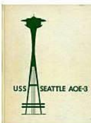
USS SEATTLE AOE-3 (cover). SN Price and SN Filighia, eds. N.p., (1971); Unpagged, white hardcover with green printing and green silhouette of the Seattle Tower.