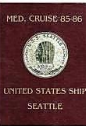
MED. Cruise 85-86, United States Ship SEATTLE (cover). Maroon hardcover with gold printing and embossed gold ship's crest.