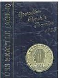
Operation PROVIDE COMFORT, 1993. Anon. Marceline, Missouri: Walsworth Publishing Company, (1993). 128 pp., blue hardcover with gold printing, gold piping, and embossed gold ship's crest.