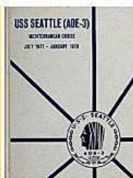
King of the MED. Cover: USS SEATTLE (AOE-3), Mediterranean Cruise, July 1977 - January 1978. LTJG Spalding et al, eds. Norfolk, Virginia: Tiffany Publishing Co., (1978). Unpagged, white hardcover with blue printing, blue piping, and blue ship's crest.