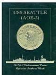
USS SEATTLE (AOE-3), 1997-98 Mediterranean Cruise, Operation SOUTHERN WATCH. Anon. N.p., (1998). 104 pp., green hardcover with light green printing, light green piping, light green silhouette of the ship and embossed gold ship's crest.