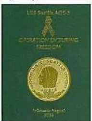
USS SEATTLE AOE-3, Operation ENDURING FREEDOM, February/August, 2002 (cover). Green hardcover with gold printing and embossed gold ship's crest.