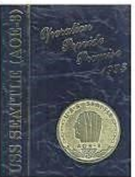
USS SEATTLE (AOE-3), Operation PROVIDE COMFORT, 1993. Anon. Marceline, Missouri: Walsworth Publishing Company, (1993). 128 pp., blue hardcover with gold printing, gold piping, and embossed gold ship's crest.