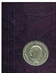
U.S.S. SEATTLE, Voyage 1981. Cover: Voyage 1981. Anon. N.p., (1981). 112 pp., brown hardcover with raised printing, raised piping and embossed gold ship's crest.