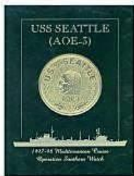
USS SEATTLE (AOE-3), Cover: USS SEATTLE (AOE-3), 1997-98 Mediterranean Cruise, Operation SOUTHERN WATCH. Anon. N.p., (1998). 104 pp., green hardcover with light green printing, light green piping, light green silhouette of the ship and embossed gold ship's crest.