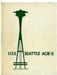
USS SEATTLE AOE-3 (cover). SN Price and SN Filighia, eds. N.p., (1971); Unpaged, white hardcover with green printing and green silhouette of the Seattle Tower.