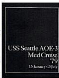
USS SEATTLE AOE-3, MED Cruise '79, 16 January - 13 July. Anon. Norfolk, Virginia: Tiffany Publishing Company, (1979). Unpaged, black hardcover with white printing and white piping.