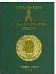
USS SEATTLE AOE-3, Operation ENDURING FREEDOM, February/August, 2002 (cover). Green hardcover with gold printing and embossed gold ship's crest.