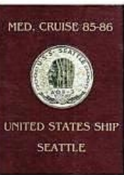
MED. Cruise 85-86, United States Ship SEATTLE (cover). Maroon hardcover with gold printing and embossed gold ship's crest.