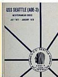
King of the MED. Cover: USS SEATTLE (AOE-3), Mediterranean Cruise, July 1977 - January 1978. LTJG Spalding et al, eds. Norfolk, Virginia: Tiffany Publishing Co., (1978). Unpaged, white hardcover with blue printing, blue piping, and blue ship's crest.