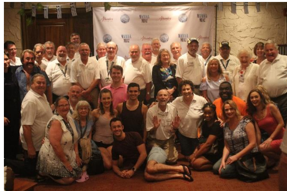
Seattle Sailors with the full cast!!!