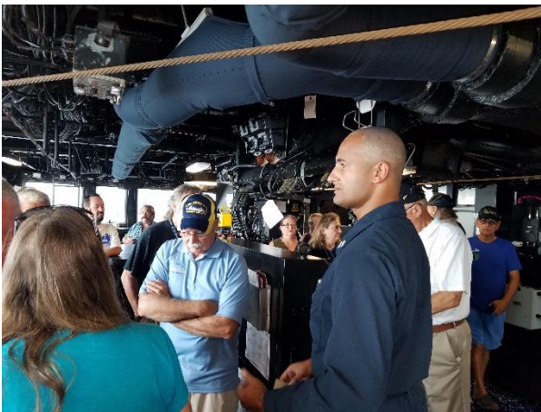
Our tour guide on the bridge showed us the new controls on the bridge being replaced by the old system of control!!!