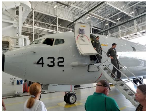
Our afternoon we first got to tour one of the newest Naval aircraft, the P-8 Poseidon.