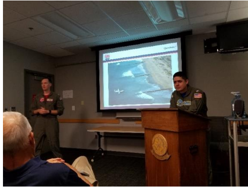
Thursday morning we had a briefing about the Trident.