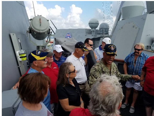
The Captain came out on the bridge wing and visited with us for almost half an hour showing Respect and honor individually for our service!!!