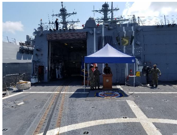
Tour of the USS Paul Ignatius.