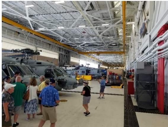
The hangar where we toured was enormous and we saw many things going on including students learning maintenance of the hellos.