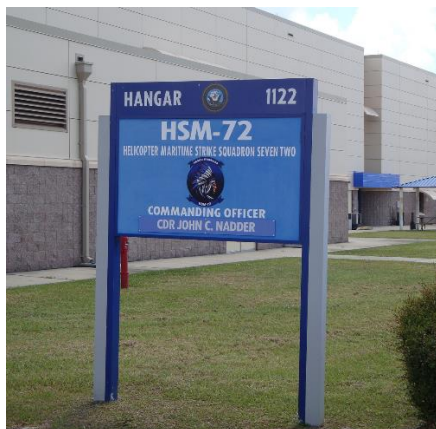
Next we got to see the Helicopter Strike Squadron Hangar