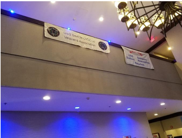
Our hotel hosted two ship reunions which allowed us to make new friends!!!

Another example of how our Association towers!!!