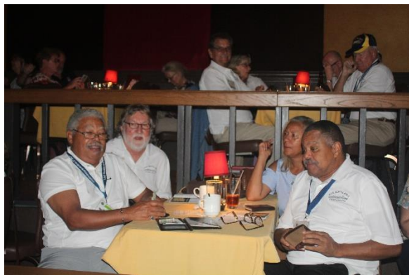
Dinner theater MAMMA MIA