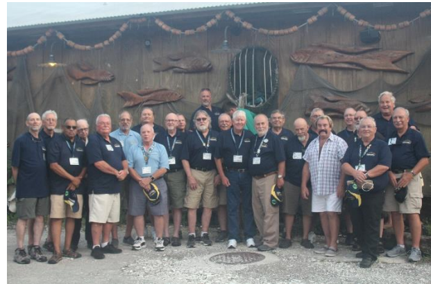
Another photo op at Dave's