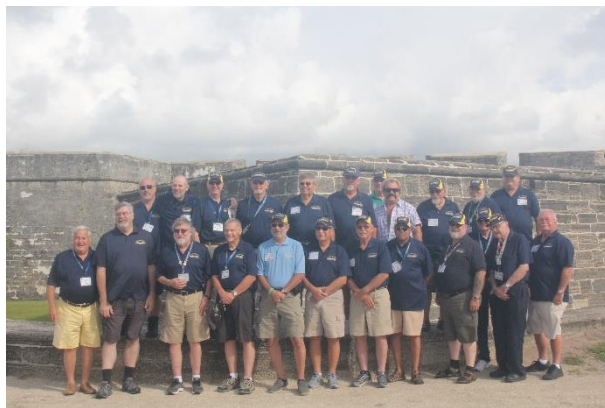
Photo op at St. Augustine